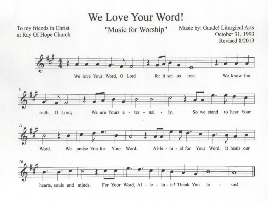
©1993 by Gaude! Liturgical Arts. All Rights Reserved. International Copyright Secured. Reprinted here under CCLI#706121

Reader: The Gospel reading is Mark, chapter 13:32-37, in the NRSV updated edition of 2021. The 1989 pew Bibles have a similar reading on page 51 in the Second Testament.